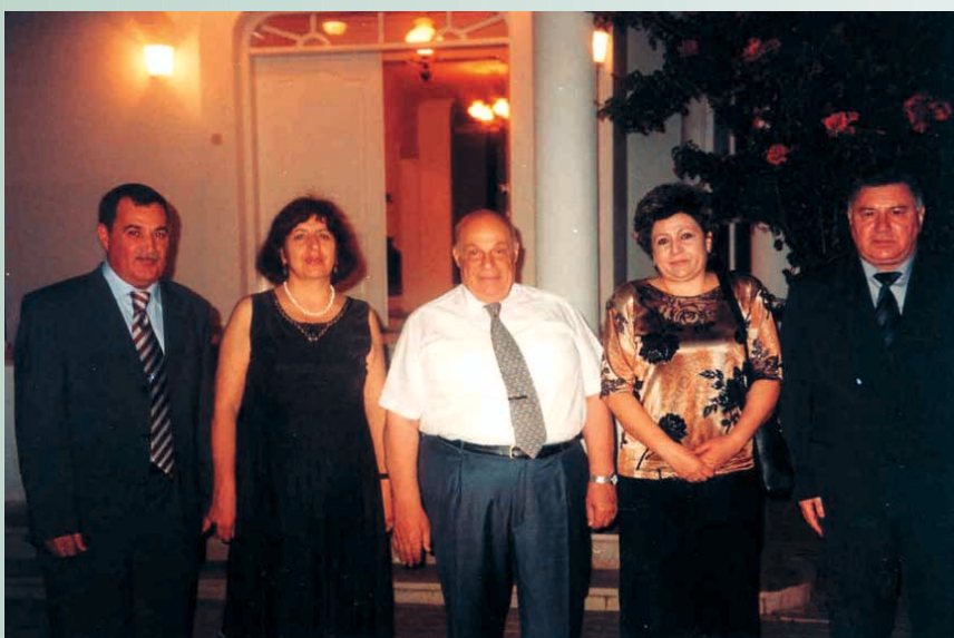
Azerbaijani delegation with H.E. Rauf Denктаş, President of the Turkish Republic of Northern Cyprus