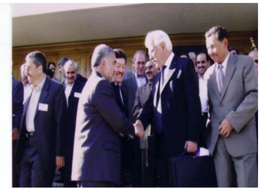
Members of the 80 ECOSAT Board of Governors posing ighth for Insteppeational Seminar and Third Train hands on the success of the session